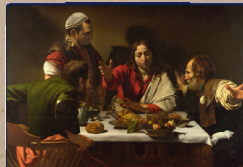
Caravaggio 1571- 1610