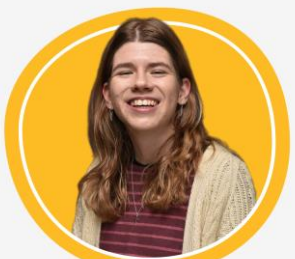
Nat C1 Teaching Assistant