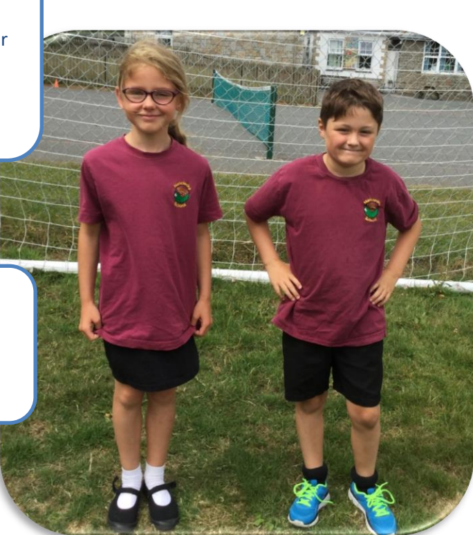
Page 5 of 5

Nancledra PE T-Shirt. Black shorts or skorts. Plimsolls or trainers.